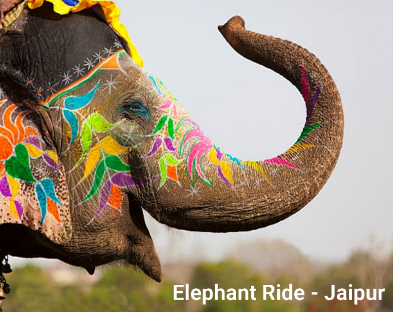
Elephant Ride - Jaipur