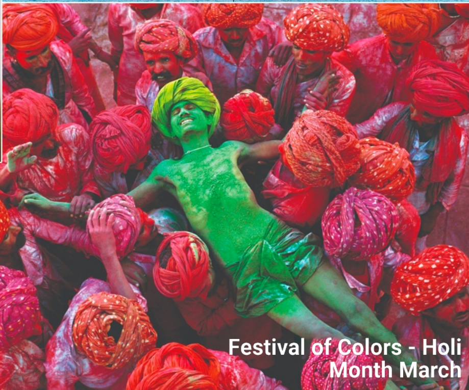
Festival of Colors - Holi Month March