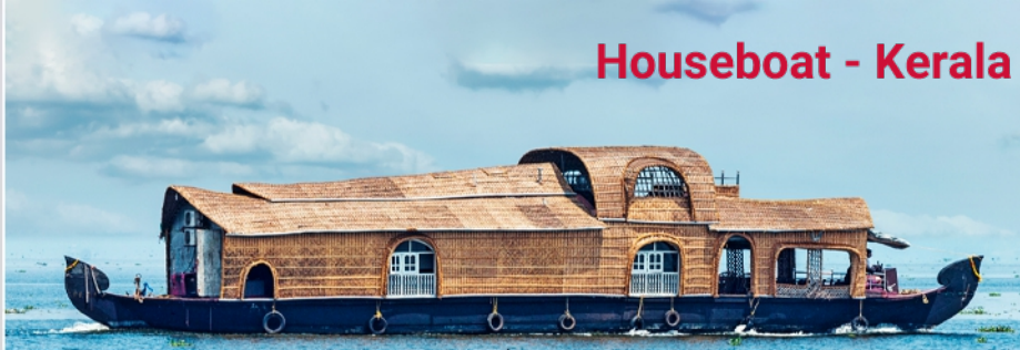
Houseboat - Kerala