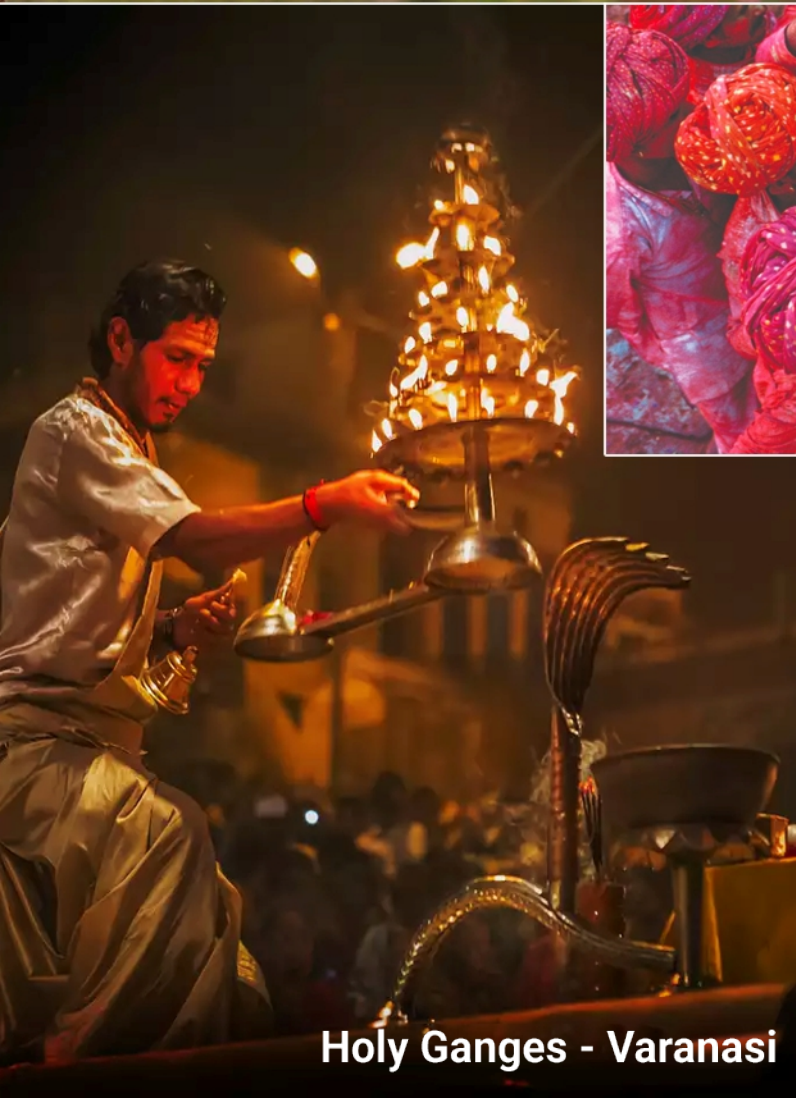
Holy Ganges - Varanasi